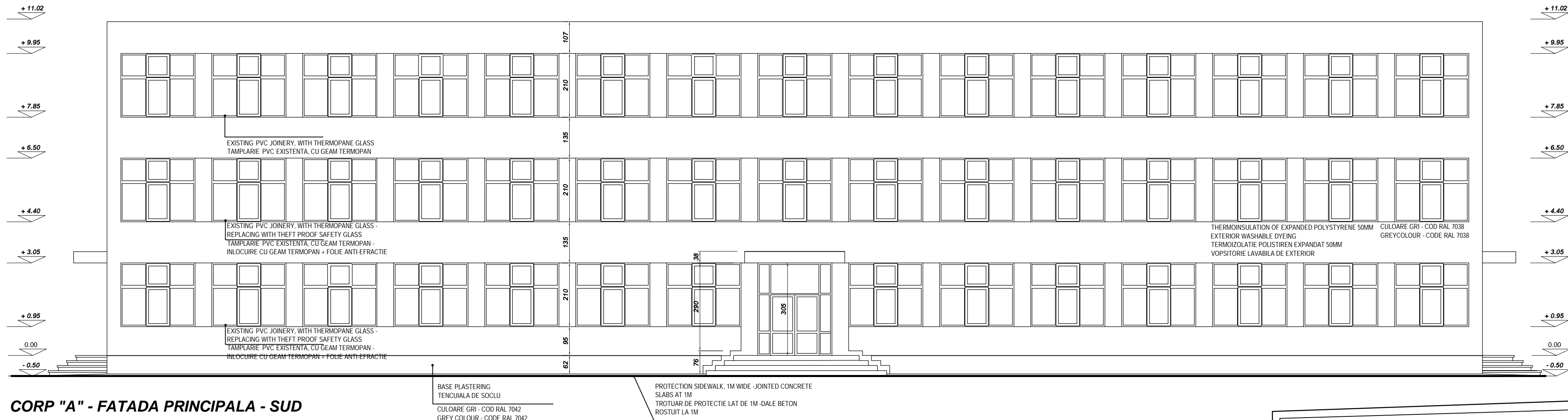
CORP "A" - FATADA PRINCIPALA - SUD